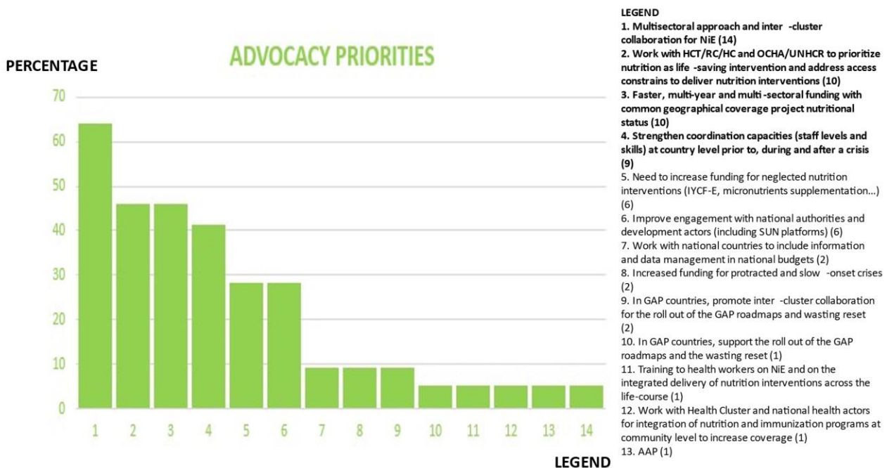
Table 1: Advocacy priorities identified by Cluster Partners by order of priority